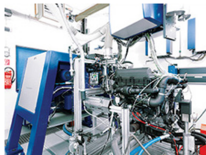
AVL Develops Dynamic Controller for Engine Conditioning System Using Embedded Code Generation for PLCs

User Story: AVL Develops Dynamic Controller for Engine Conditioning System Using Embedded Code Generation for PLCs