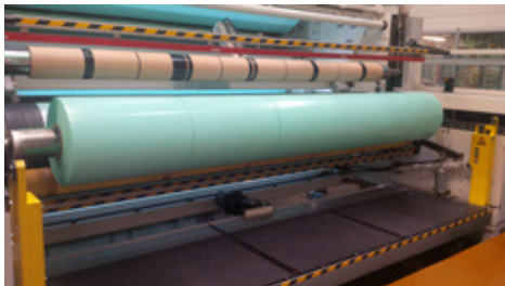
Mondi Implements Statistics-Based Health Monitoring and Predictive Maintenance for Manufacturing Processes with Machine Learning

Engineers working with large amounts of business and engineering data use machine learning to find patterns and build models to predict future outcomes based on historical data (such as for predictive maintenance ).